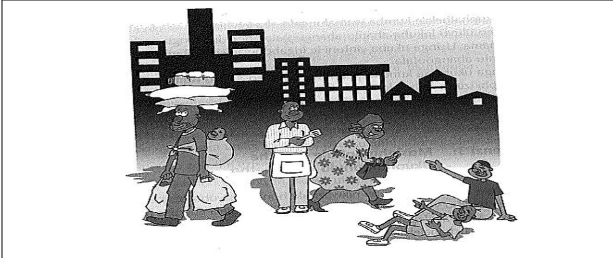
[Singcamla ingqaka, ibanga le-10, iphepha lama-201]

2.1 Kulo mfanekiso ungentla kukho indoda ebeleke umntwana . Le ndoda ibonakala isindwa yimithwalo eyithwele entloko, eminye isezandleni.