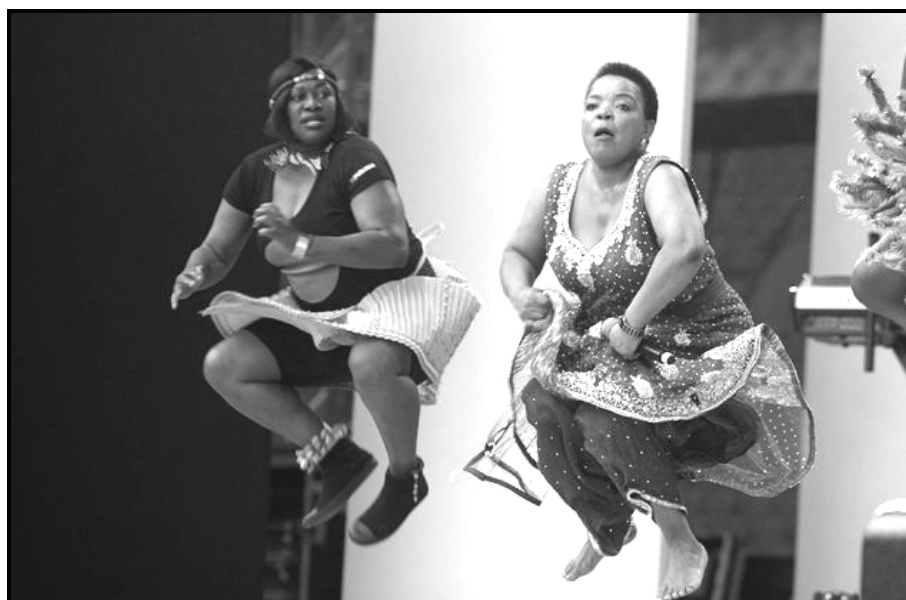
[Ithathwe kwi-Intanethi yaza yahlelwa]

5.2 Jonga lo mfanekiso uze uphendule imibuzo elandelayo.