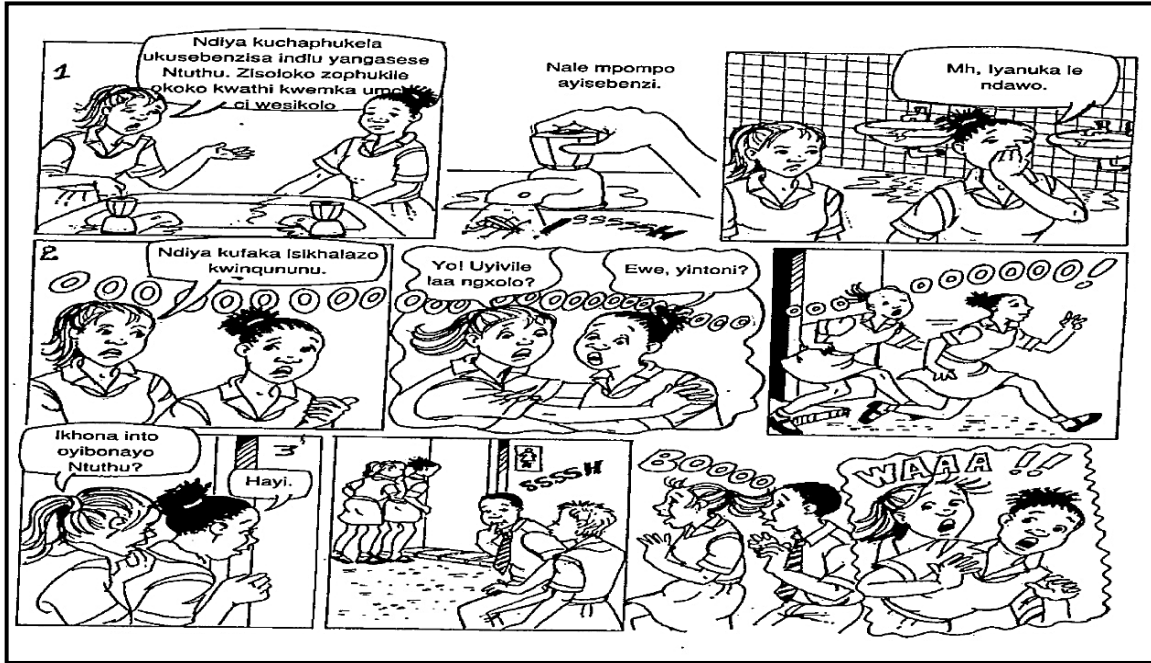
[Ithathwe kwi-Intanethi yaze yahlelwa]

Funda le khathuni ilandelayo uze uphendule imibuzo engezantsi.