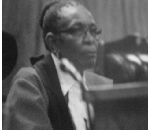
INGABA UJAJI MASIPA WENZE OKULUNGILEYO?

Funda isicatshulwa uze uphendule imibuzo elandelayo.