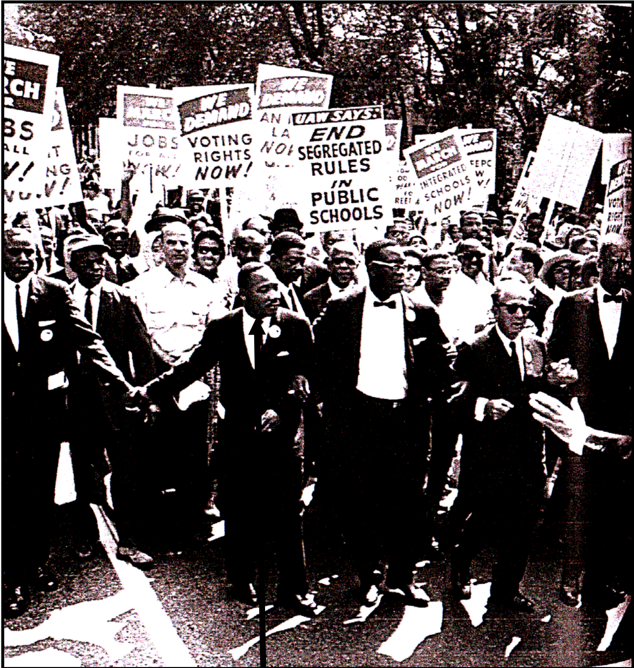
Martin Luther King Jr.