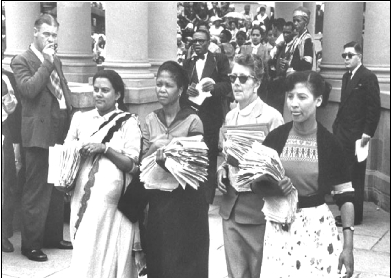
[From: Apartheid to Democracy: South Africa 1948–1994 by T Nuttal et al.]