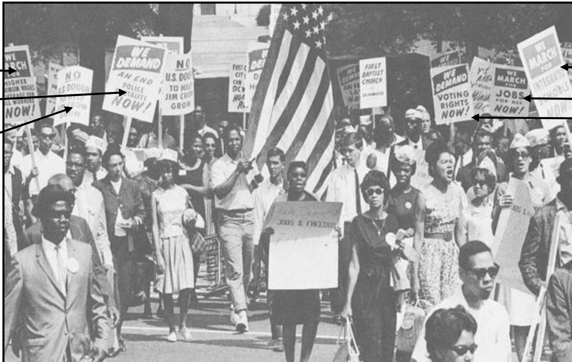
[From The Day They Marched by DE Saunders]

The photograph below is from a book titled The Day They Marched by DE Saunders. It shows civil rights marchers on the way to Washington, carrying placards during the March on Washington on 28 August 1963.