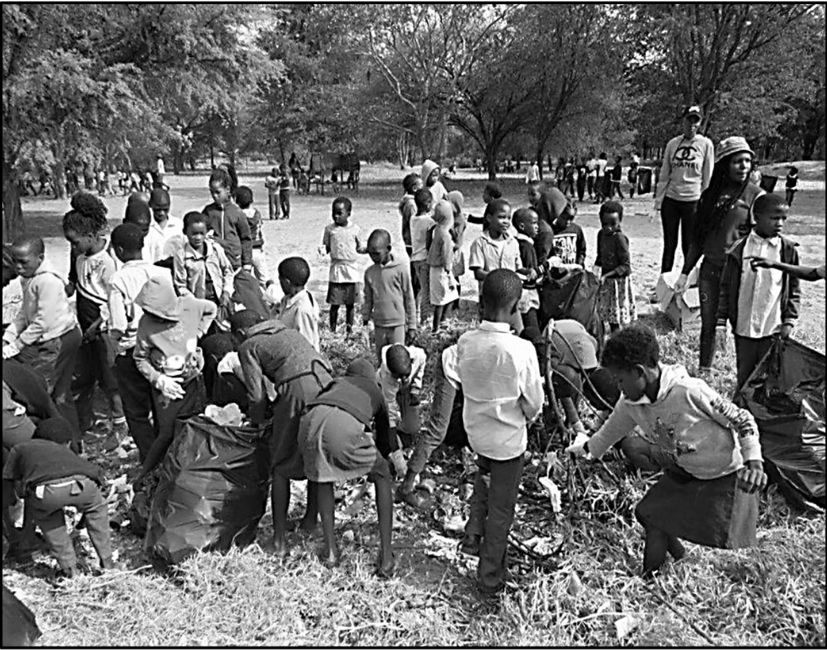
[Sicatshulwe kwi-intanethi https://www.childreninthewilderness.com . Saze sahlelwa.]